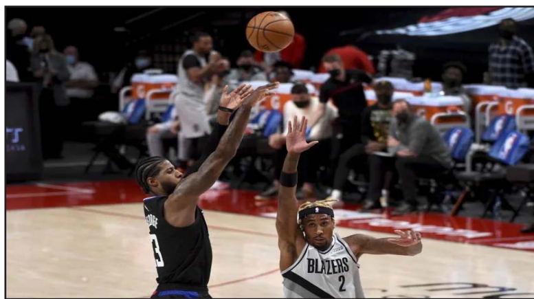
Clippers guard Paul George hits a shot over Portland Trail Blazers forward Rondae Hollis-Jefferson during the first half in Portland, Ore., on Tuesday.

The Clippers, the Western Conference's third-place team, were missing All-Star Kawhi Leonard — who will be out at least three games while managing soreness in his right foot — as well as starters Serge Ibaka and Patrick Beverley and because of it, used this season's 21st different start-