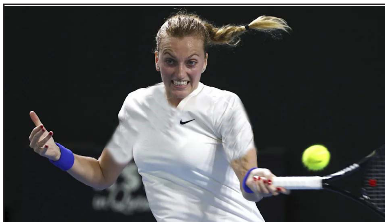
STUTTGART, Germany (AP) — Petra Kvitova opened her delayed title defense at the Porsche Grand Prix with a 6-4, 6-3 win

over Australian Open finalist Jennifer Brady on Tuesday.