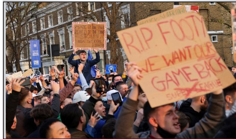
Football supporters demonstrate against the proposed European Super League outside of Stamford Bridge football stadium in London on April 20, 2021.

LONDON (Dispatches) - Europe's rebel soccer league crumbled just days after its launch as teams pulled out amid fury from the sport's authorities, politicians and fans.