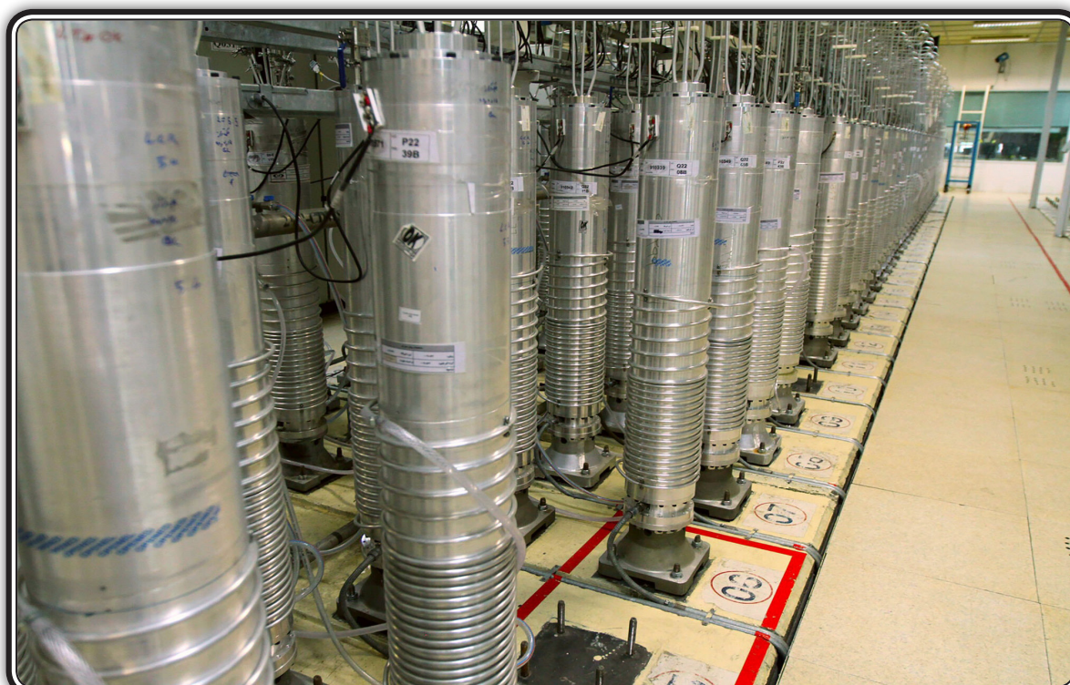
This photo shows centrifuges at the Natanz uranium enrichment plant in central Iran in 2019.

VIENNA (Dispatches) – Iran has told the UN nuclear agency it plans to install three more cascades, or clusters, of advanced IR-2m centrifuges at its underground uranium enrichment plant at Natanz, the agency told member states on Friday in a report cited by Reuters.