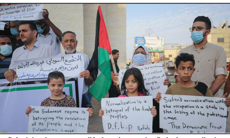
Palestinian demonstrators lift placards protesting Sudan's normalization agreement with the Zionist regime, in Rafah town in the southern Gaza Strip on October 24, 2020.

MUSCAT (Dispatches) – Zionist regime officials say Oman is likely the next Arab country to normalize ties with the occupying regime after the United Arab Emirates, Bahrain, and Sudan reached normalization deals with the regime.