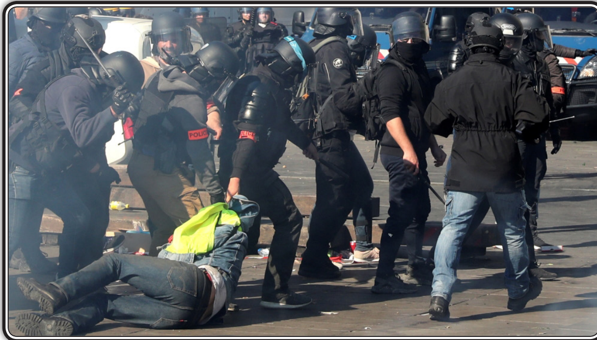
Riot police drag a protester during a demonstration of the yellow vests movement in Paris.

GENEVA (Dispatches) – Iran’s ambassador to the UN office in Geneva has censured Germany and several other countries for baselessly criticizing the human rights situation in Iran while trying to appease the United States by turning a blind eye to its criminal sanctions, which “grossly” violate the Iranian people’s most basic rights.