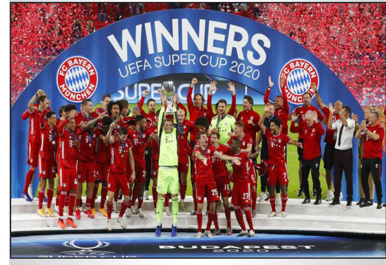
Bayern Munich's captain and goalkeeper Manuel Neuer lifts the trophy after the UEFA Super Cup soccer match between Bayern Munich and Sevilla at the Puskas Arena in Budapest, Hungary, Sept 24, 2020. Bayern won the match 2-1 after extra time.

Munich beat Sevilla 2-1 in an epic battle for the UEFA Super Cup that lasted 120 minutes on Thursday.