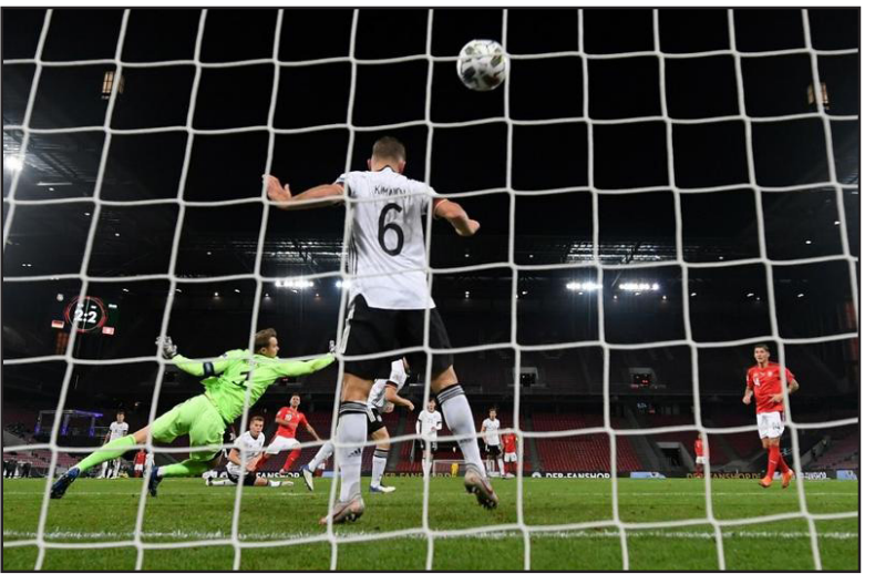
Germany's goalkeeper Manuel Neuer fails to save the ball during the UEFA Nations League football match Germany v Switzerland in Cologne, Western Germany, on Oct 13, 2020.

Switzerland continued on the front foot and doubled their lead on 26 minutes when Toni Kroos' misplaced pass