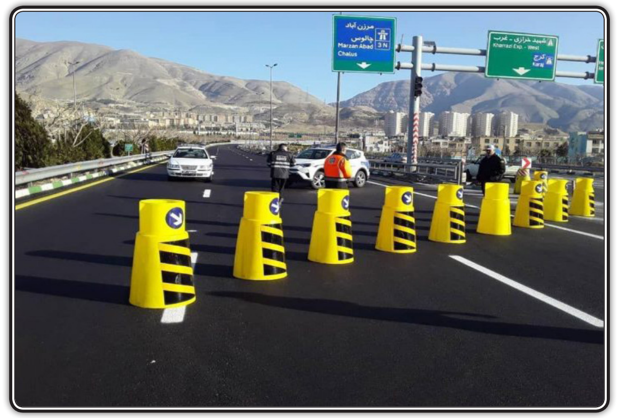
The travel bans would be imposed in five cities with the highest rate of infection, namely Tehran, Karaj, Mashhad, Isfahan and Orumiyeh.

TEHRAN (Dispatches) - The Iranian president has approved a proposal to impose three-day travel restrictions in five cities hit hardest by the coronavirus outbreak, the health minister said.