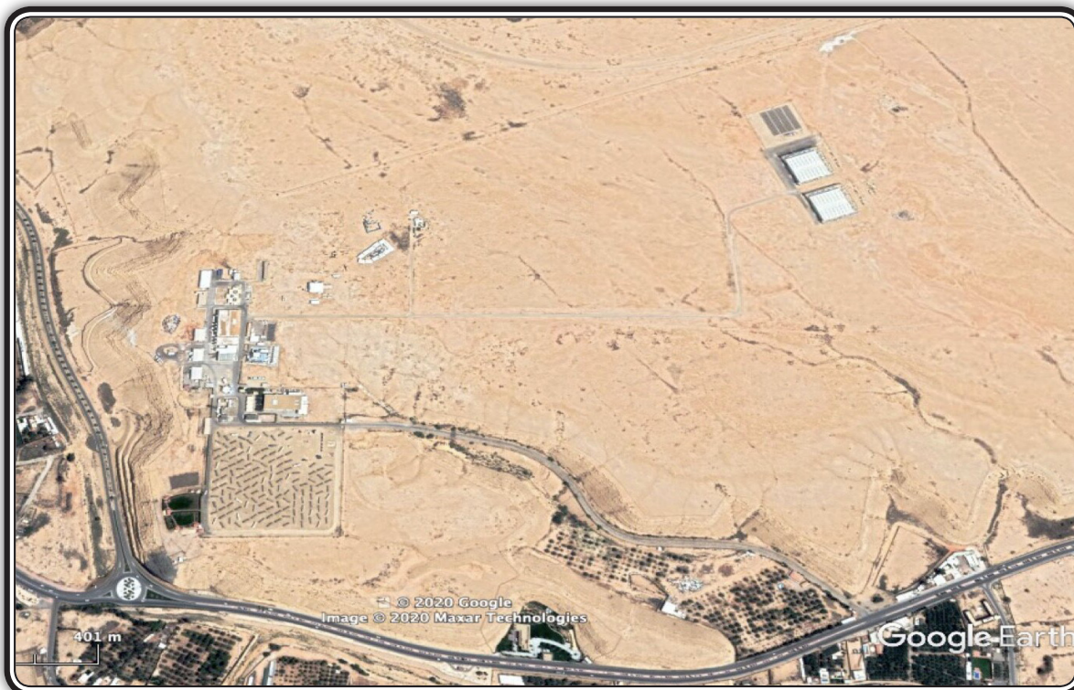
An image taken May 27 shows, top right, two square buildings that some analysts think could be a Saudi nuclear facility. It is located near the Solar Village, bottom left.

VIENNA (Dispatches) – Iran on Saturday urged the International Atomic Energy Organization (IAEA) to investigate Saudi Arabia's "covert" nuclear program.