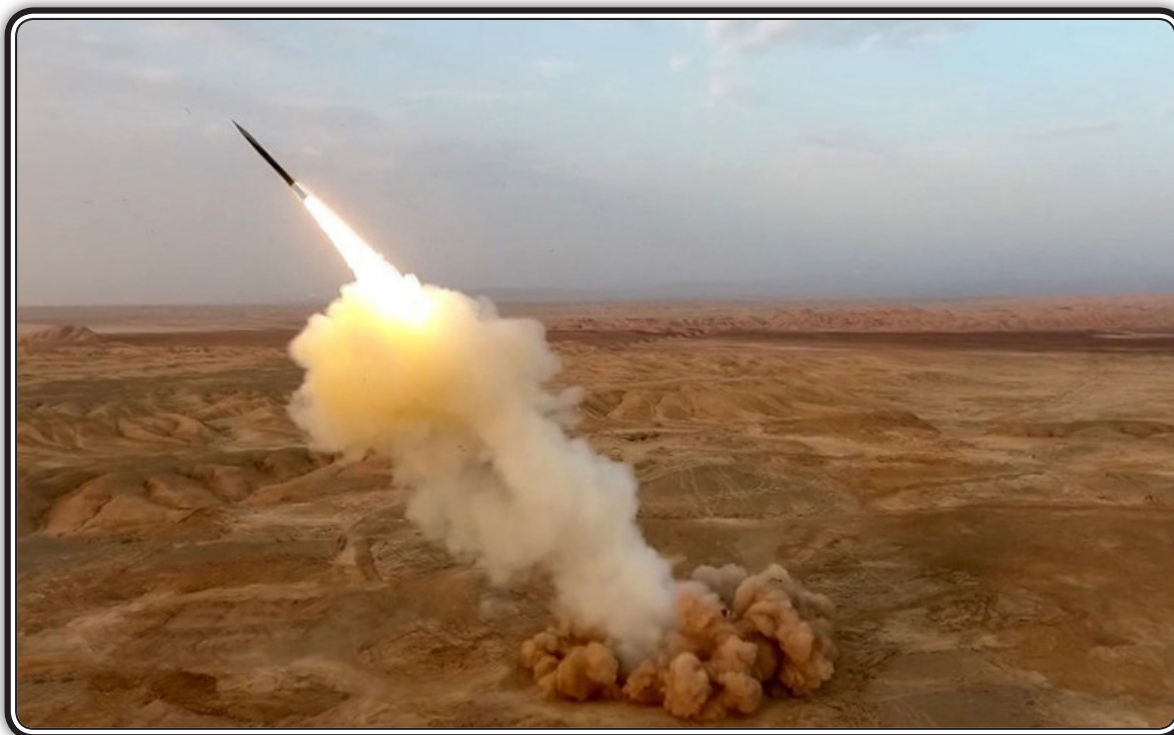
Iranian armed forces launched missiles "buried underground" during military drills.

LONDON (Dispatches) -- Iranian armed forces launched missiles "buried underground" during military drills intended to send a deadly warning to the U.S., a British newspaper wrote on Saturday.