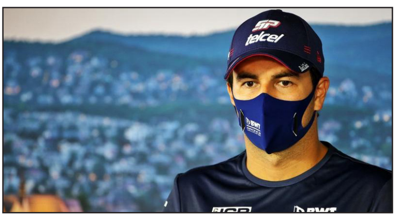
Racing Point's Mexican driver Sergio Perez addresses the drivers' press conference for the Formula One Hungarian Grand Prix at the Hungaroring circuit in Mogyorod near Budapest, Hungary, on July 16, 2020.

Racing Point share reserves with engine supplier Mercedes, who have Belgian Stoffel Vandoorne and Mexican Esteban Gutierrez in those roles.