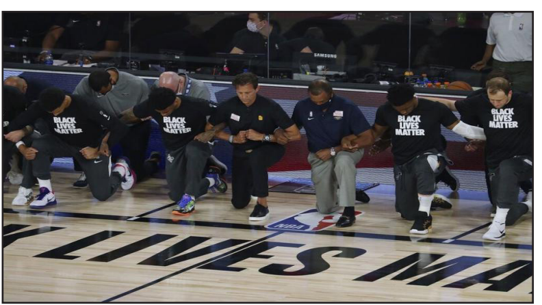
Players and coaches kneel during the national anthem before the Utah Jazz against the New Orleans Pelicans NBA basketball game, July 30, 2020, in Lake Buena Vista, U.S.

Black Lives Matter was also written on the courts at the ESPN Wide World of Sports Complex in the Walt Disney World Resort near Orlando, where the NBA plans to finish its season with 22 teams