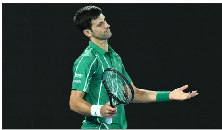
Novak Djokovic says he's the subject of an 'agenda' and 'witch hunt' after the Adria Tour he organized during the pandemic.

Tennis stars slammed the event in Croatia with Nick Kyrgios calling it a "boneheaded decision" to play the exhibi-