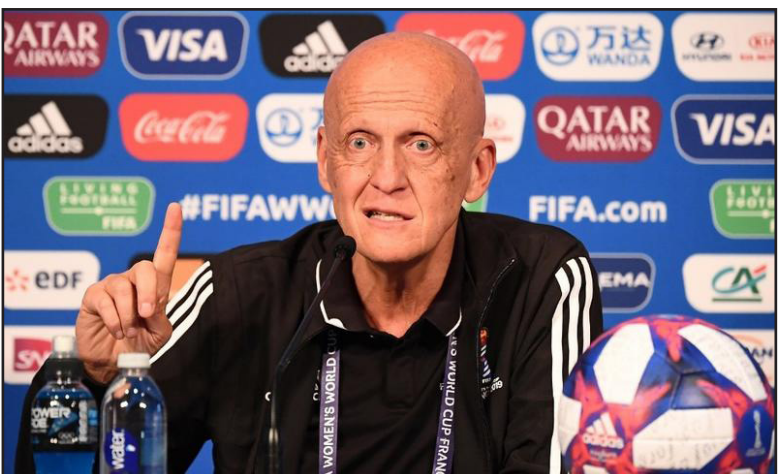
In this June 26, 2019 photo, FIFA's Referees Committee Italian chairman Pierluigi Collina gestures as he gives a press conference during the France 2019 Women's football World Cup in Paris.

MANCHESTER, England (Dispatches) - FIFA wants VAR video reviews to be applied in the same way across all competitions, as they take over direct responsibility for the system.