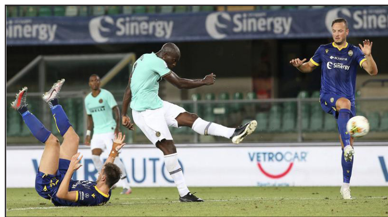
Inter Milan's Romelu Lukaku shoots during the Serie A soccer match between Hellas Verona and Inter Milan, at the Marcantonio Bentegodi Stadium in Verona, Italy, July 9, 2020.

ROME (Dispatches) - Inter Milan have slipped to the fourth place in the Serie A after playing out a 2-2 draw against Hellas Verona in a topsy-turvy thriller.