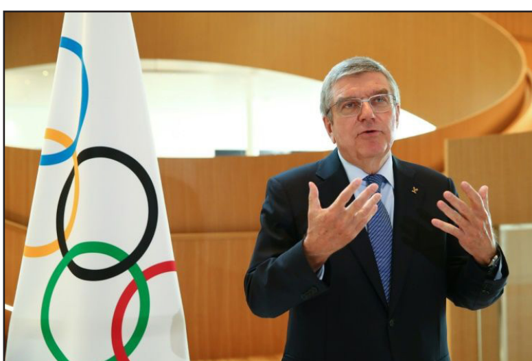
International Olympic Committee President Thomas Bach

to hear "thoughts, ideas and experiences of all members