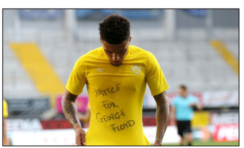
Dortmund's English star Jadon Sancho shows a "Justice for George Floyd" shirt

BERLIN (AFP) - England winger Jadon Sancho revealed a T-shirt on Sunday demanding "Justice for George Floyd", another protest in the Bundesliga this weekend at the death of an unarmed black man in the United