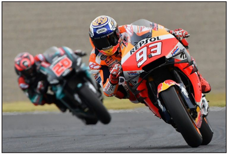
The Japanese race is a long-standing fixture on the MotoGP circuit

hopes to resume with back-toback races at Jerez, Spain.