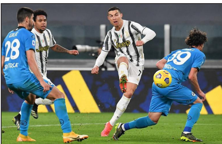
Juventus' Portuguese forward Cristiano Ronaldo shoots on goal during the Italian Serie A football match Juventus vs Spezia on March 02, 2021 at the Juventus stadium in Turin.

MADRID (Reuters) - Real Madrid coach Zinedine Zidane left the door open for Cristiano Ronaldo to return to the club, three years after he left to join Juventus.