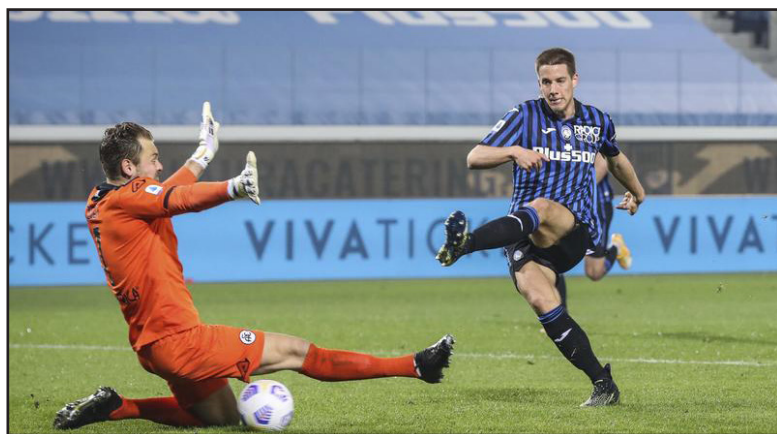
Atalanta's Mario Pasalic, right, scores during the Italian serie A soccer match between Atalanta and Spezia at the Gewiss stadium in Bergamo, Italy, March 12, 2021.

Atalanta will try to overturn a 1-0 first-leg deficit when it visits Real Madrid in the round of 16 on Tuesday. Then Lazio needs to make up for a 4-1 first-leg loss