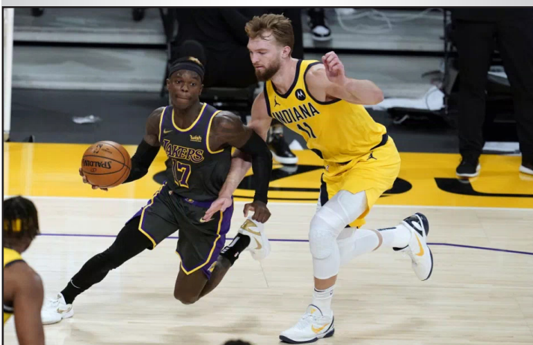
Los Angeles Lakers guard Dennis Schroeder, left, drives against Indiana Pacers forward Domantas Sabonis during the first half of an NBA basketball game Friday, March 12, 2021, in Los Angeles.

LOS ANGELES (AP) - Kyle Kuzma scored 15 of his 24 points in the fourth quarter, LeBron James added 18 points and 10 assists, and the Los Angeles Lakers rallied late for a 105-100 victory over the Indiana Pacers on Friday night.