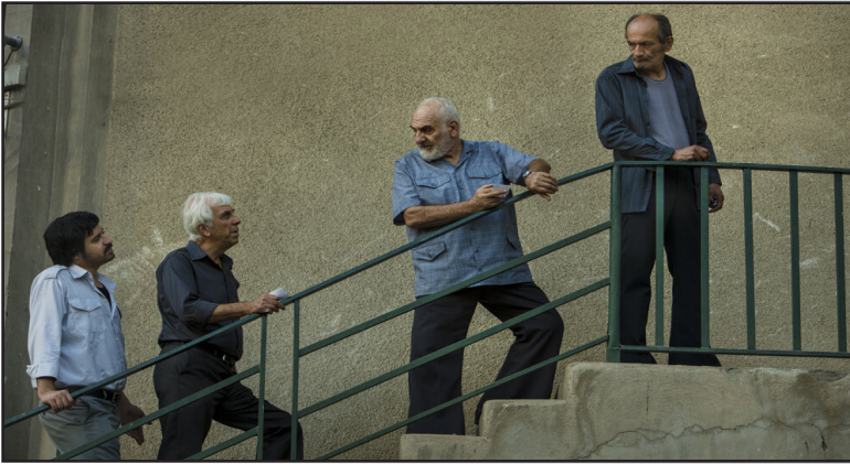
A still from Iranian movie ‘Careless Crime’.

The 45th edition of the HKIFF is slated for April 1-12, 2021.