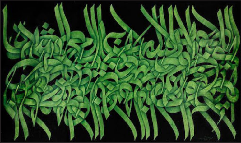
A work by Iranian artist Mohammad Ehsaei .

10 solar years ago , on this day in 2011 AD, the repressive Aal-e Khalifa minority regime of the Persian Gulf island state of Bahrain imposed martial law in a bid to quell the people’s popular uprising. At the same time, the regime invited some 1,000 Saudi troops to invade Bahrain and crush the Islamic movement.