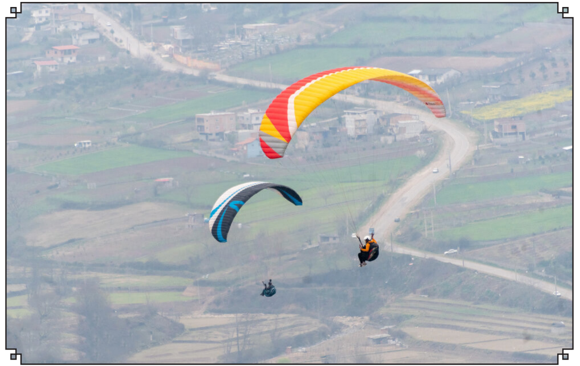
Paragliding competition has been held in Sari, Mazandaran, northern province of Iran.