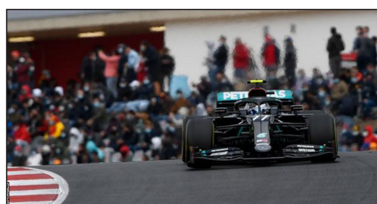
Before last year, the Portuguese GP was last held in 1996

President Stefano Domenicali said: "We are confident and excited about our 2021 season, having shown last year that we could deliver 17 races safely."