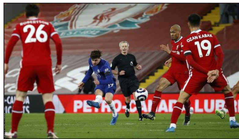
Defeat to Chelsea saw Liverpool slip to seventh in the Premier League

who has long linked with a move to Liverpool before arriving at Stamford Bridge, has now scored just once in his last 18 Premier League games.