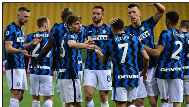
Inter Milan lead Serie A by six points

MILAN (Dispatches) - Alexis Sanchez has scored twice to earn Inter Milan a 2-1 win at Parma and move them six points clear at the top of Serie A.