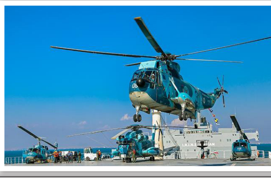
This combination shows the Zereh and the Makran joining a navy drill in the Gulf of Oman while Chief of Staff Gen. Muhammad Baqeri and other military commanders watch off the southeastern coast of Iran.

TEHRAN (Dispatches) -- Iran's navy began a short-range missile drill in the Gulf of Oman on Wednesday amid provocative moves by the U.S. military in the region.