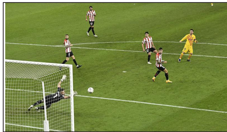
Barcelona's Lionel Messi, right, scores his team's third goal during the Spanish La Liga soccer match between Athletic Bilbao and Barcelona at San Mames stadium in Bilbao, Spain, Jan 6, 2021.

BILBAO, Spain (Reuters) - Lionel Messi was at the top of his game as Barcelona earned a 3-2 win at Athletic Bilbao to move up to third in La Liga.