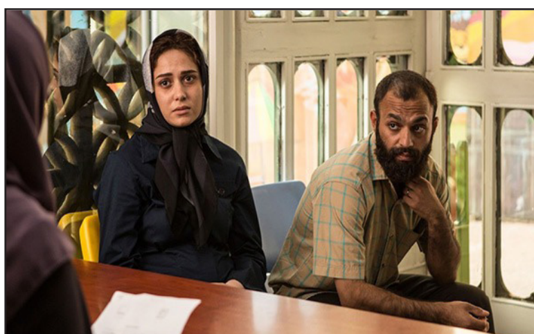
A still from Iranian short film 'Zen'.

TEHRAN (IFILM) -- Iranian short film 'Zen' has won an