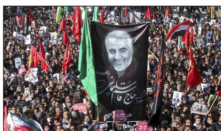
Commander Lieutenant General Qassem Soleimani's Funeral.

Produced with contributions from Iran's Cultural Office in Athens, 'Farewell to the Hero' begins with the voice of the commander announcing the end of Daesh. The Greek TV channels' cov-