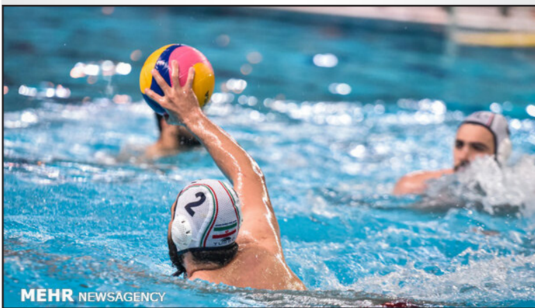
The Iranian team conceded a 27-4 defeat against the United States in the 2019 edition of FINA World Men's Junior Water Polo Championships on Friday.

TEHRAN (Dispatches) – Iran was defeated against USA 27-4 at Group C of the 20th FINA World Men's Junior Water Polo Championships on Friday.