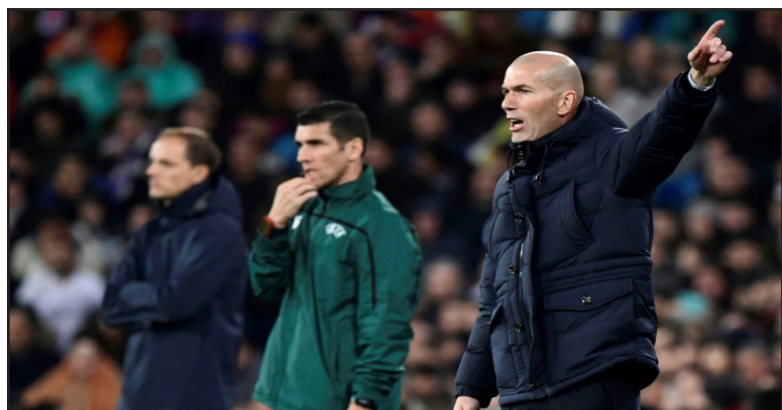
Zinedine Zidane insists Real Madrid will not have one eye on the Clasico when they face Valencia in La Liga on Sunday.

But Zidane's team cannot afford to underestimate Valencia, who have registered three consecutive victories, including one away at Ajax on Tuesday that secured qualification for the Champions League last 16 as group winners. Valencia sit eighth, while Barcelona