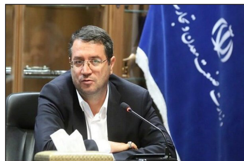
Iran's Minister of Industry, Mine and Trade Reza Rahmani

The Iranian minister also called for efforts to implement the agreements that Iran and Uzbekistan have signed in the past to enhance cooperation in various sectors, such as business, transportation, encouraging foreign investment, customs issues and tourism industry.