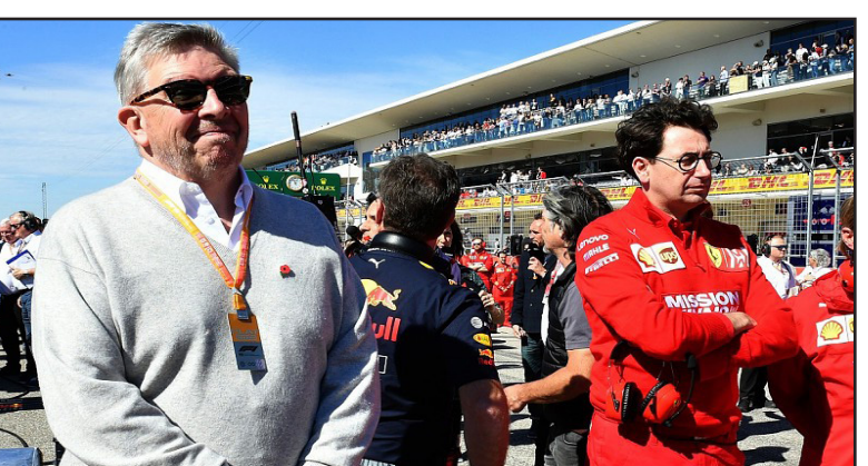
Italian team's former technical director Ross Brawn

LONDON (Reuters) – One of Ferrari's two drivers should take a leaf out of Lewis Hamilton's book and accept blame for Sunday's Brazilian Grand Prix collision, according to the Italian team's former technical director Ross Brawn .