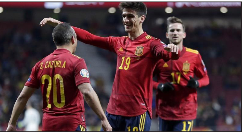
Spain's Gerard Moreno celebrates with Santi Carzola , left, after scoring his side's second goal during the Euro 2020 group F qualifying soccer match between Spain and Romania at the Metropolitano stadium in Madrid , Nov 18, 2019.

MADRID (AP) - Spain have finished their qualifying campaign