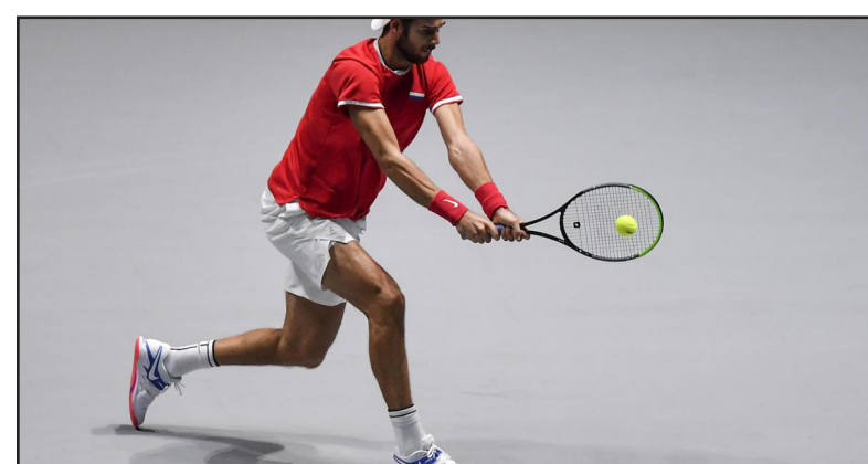
Russia's Karen Khachanov returns a shot during a Davis Cup match against Croatia.

MADRID (AFP) - Karen Khachanov and Andrey Rublev have helped Russia open the inaugural Davis Cup Finals with a 3-0 victory over defending champions Croatia in Madrid.