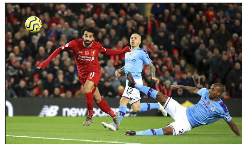
Liverpool's Mohamed Salah, left, scores his side's second goal of the game during the English Premier League soccer match at Anfield, Liverpool, England, Nov. 10, 2019.

CAIRO (AP) — Egypt's soccer federation says Liverpool forward Mohamed Salah will miss two Africa Cup of Nations qualifiers.