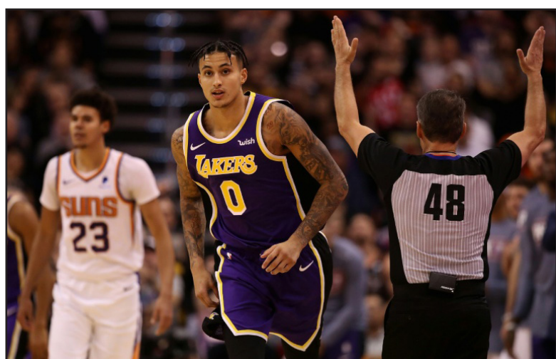
Kyle Kuzma reacts after hitting a crucial late three-pointer in the Los Angeles Lakers 123-115 win over the Phoenix Suns

A LeBron James three-pointer put the Lakers 114-113 ahead before Kuzma weighed in to stretch the lead to 120-113.