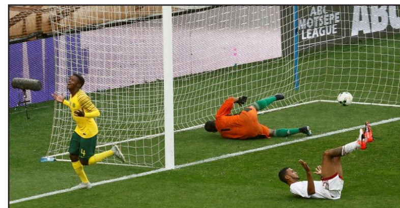
A file photo of South African Teboho Mokoena (L) celebrating scoring against the Seychelles in a 2019 Africa Cup of Nations qualifier

JOHANNESBURG (AFP) - A brilliant Teboho Mokoena free-kick goal gave South Africa a 1-0 victory over the Ivory Coast Tuesday in a 2020 Tokyo Olympic Games qualifier in Cairo.