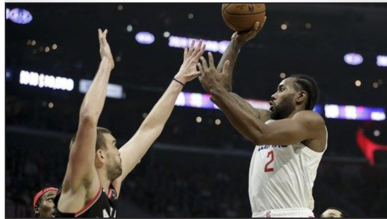
Los Angeles Clippers forward Kawhi Leonard, right, shoots over Toronto Raptors center Marc Gasol during the second half of an NBA basketball game in Los Angeles, Monday, Nov. 11, 2019.

LOS ANGELES (AP) -- Kawhi Leonard struggled on 2-for-11 shooting and had nine turnovers, but Lou Williams led a big effort from the bench with 21 points and the Los Angeles Clippers beat the defending NBA champion Toronto Raptors 98-88 on Monday night.