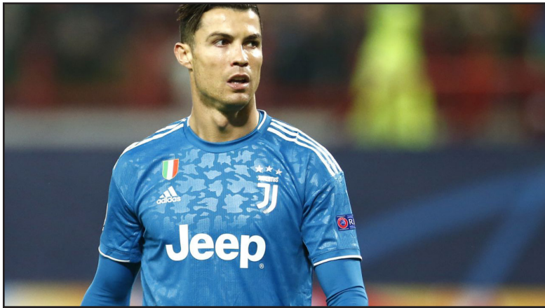
Cristiano Ronaldo left the Allianz Stadium early after being substituted.

Cassano - who enjoyed spells at Milan, Inter, Roma and Real Madrid, among others - brought up the