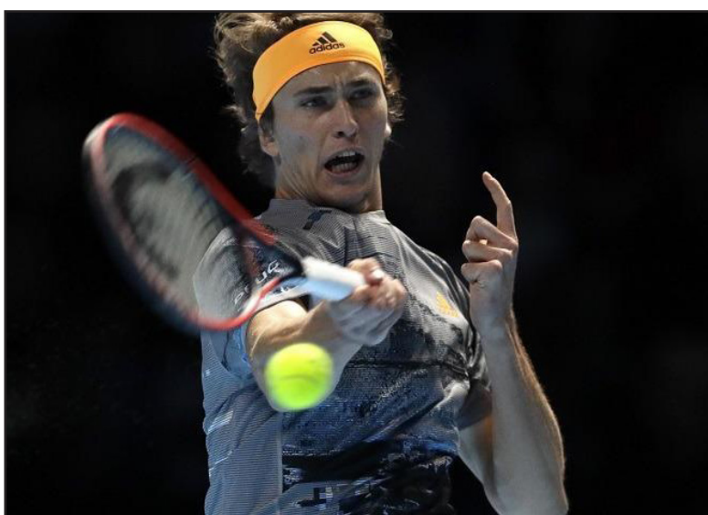
Alexander Zverev of Germany plays a return to Rafael Nadal of Spain during their ATP World Tour Finals singles tennis match at the O2 Arena in London, Nov 11, 2019.

Nadal dropped his serve three straight times, didn't force a single break point, and his