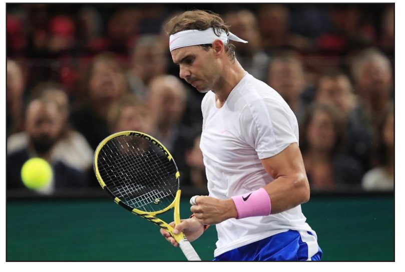
Spain's Rafael Nadal reacts after making a point against Swiss Stan Wawrinka during the 3rd round match of the Paris Masters tennis tournament in Paris, France, Oct 31, 2019.

The second-ranked Spaniard was briefly troubled in the first