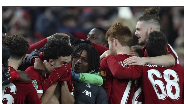
Liverpool players celebrate at the end of the English League Cup soccer match between Liverpool and Arsenal at Anfield stadium in Liverpool, England, Oct 30, 2019.