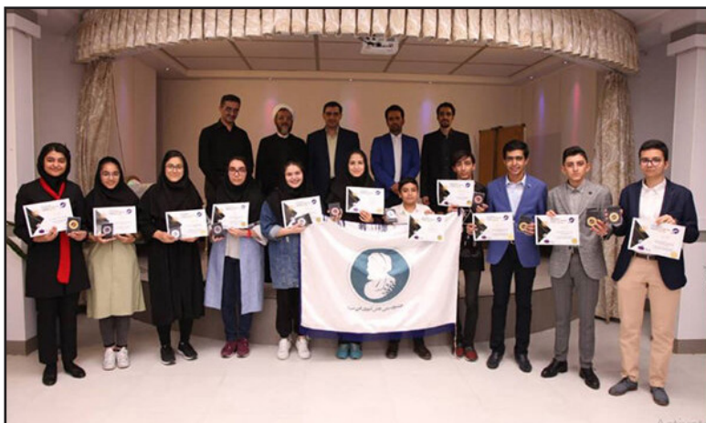
TEHRAN (MNA) – Iranian students received six medals at the International Invention & Trade Expo (ITE 2019) in London, UK.