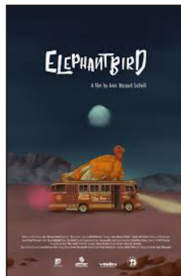
tional Film Festival was held on October 4-13, 2019.