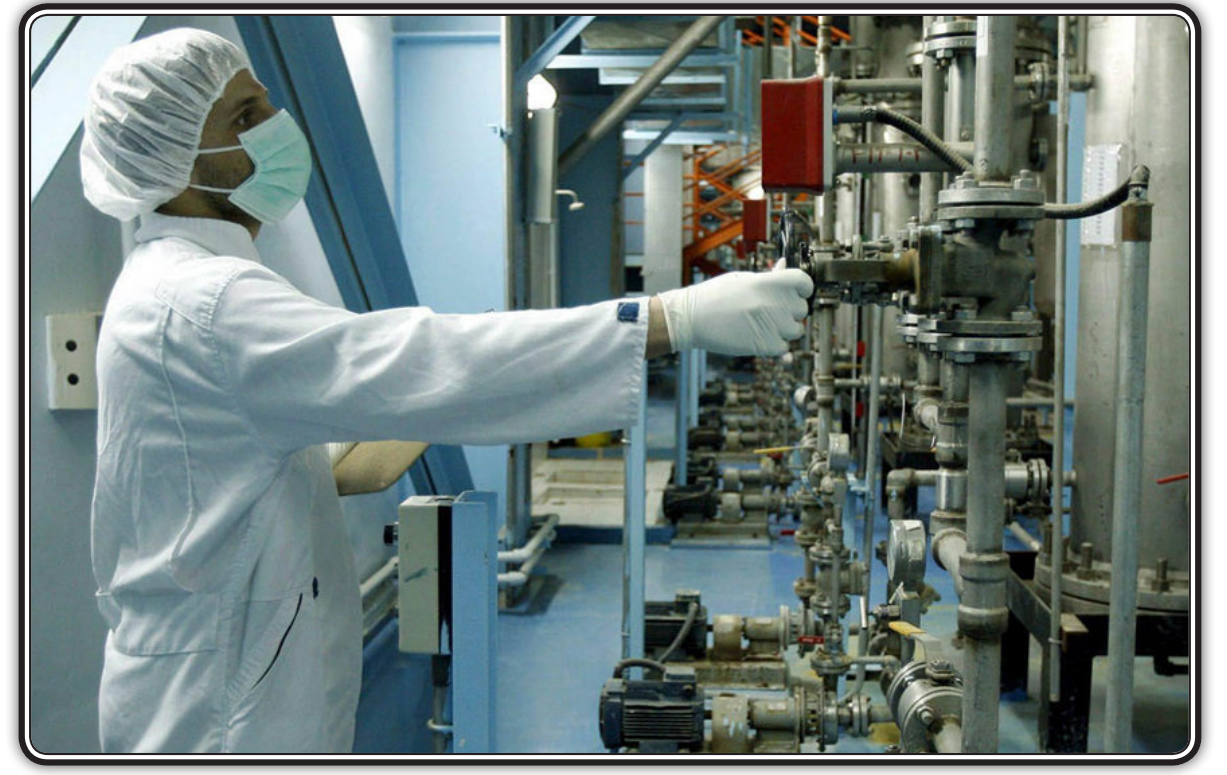
Iranian technician works at a nuclear facility.