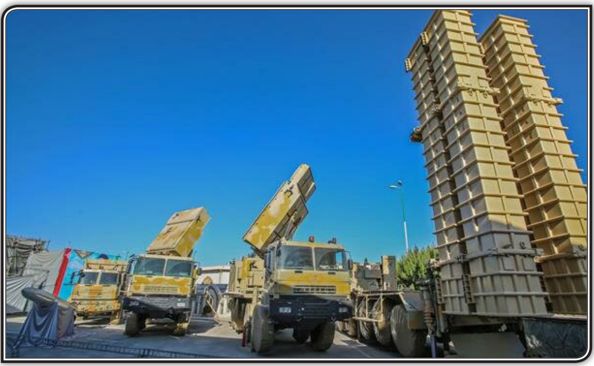
A handout picture provided by the Iranian president's website shows Iranian-made air defense missile system Bavar 373 ("faith" in Persian) during a ceremony in Tehran on August 22, 2019.