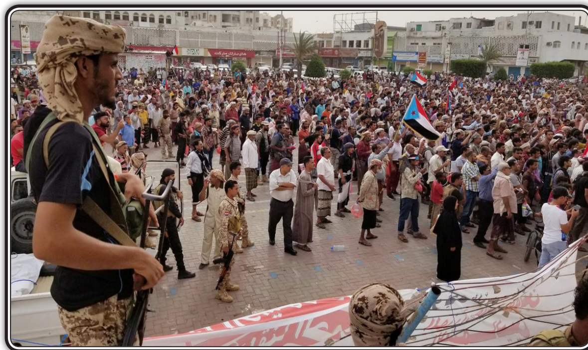
A member of UAE-backed forces stands guard as supporters of Yemen's southern separatists rally in Aden, Yemen August 6, 2019.

TEHRAN (Dispatches) -- Iran on Wednesday said it supports a unified Yemen, warning against plots aimed at dividing the war-ravaged Arab country.