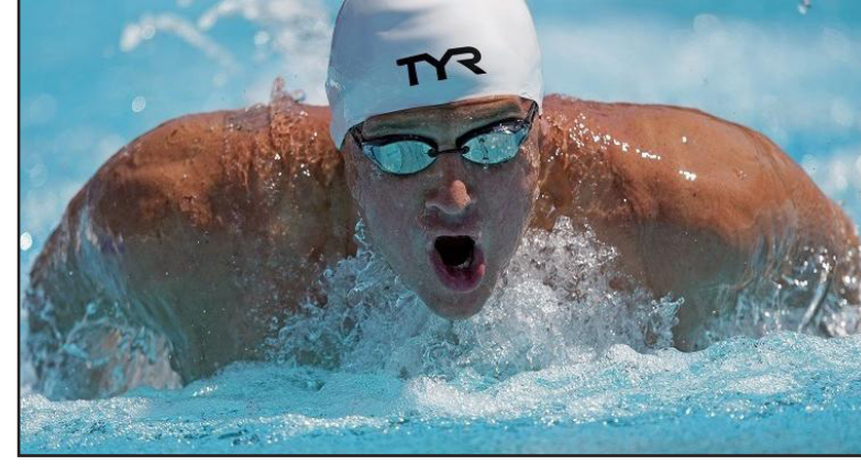
Ryan Lochte competes in the men's 200-meter individual medley time trial at the US national swimming championships in Stanford, Calif., July 31, 2019.

STANFORD, Calif. (AP) - Ryan Lochte won the 200-meter individual medley at the U.S. national championships, fresh off a 14-month ban.