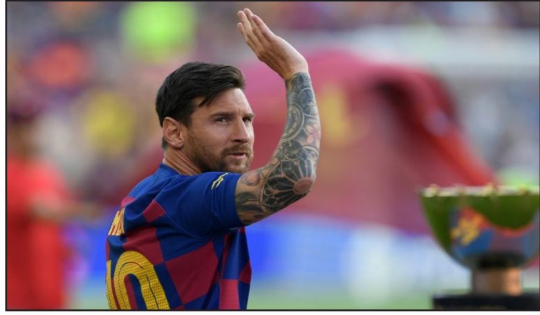
Barcelona's Argentinian forward Lionel Messi is out of action with a calf injury 10 days before the start of the new season

BARCELONA (AFP) - Barcelona captain Leo Messi is out of ac-