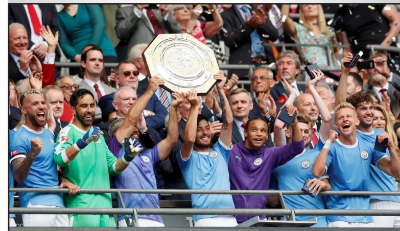
Manchester City's Sergio Aguero and David Silva celebrate winning the FA Community Shield with team mates.

MANCHESTER (Dispatches) - Manchester City have defeated Liverpool on penalties to win the Community Shield at Wembley Stadium, after the contest had finished 1-all in normal time.