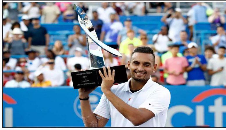
Nick Kyrgios with Citi Open trophy

Kyrgios, mixing baseline rallies with drop shots, came from 4-1