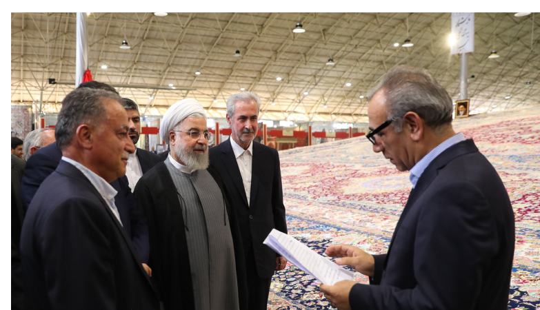
Iranian President Hasan Rouhani visited the fair during his visit to East Azerbaijan Province, and talked with carpet producers and exporters and listened to their concerns.

Tabriz International Carpet Fair will run until August 4.