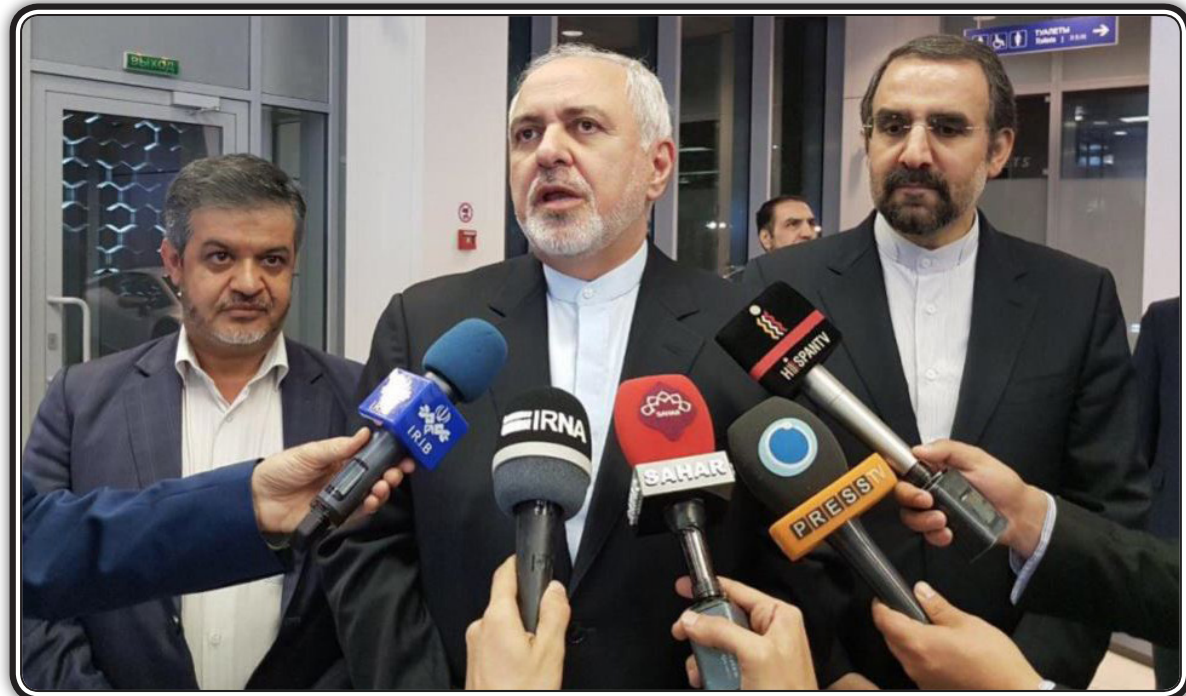
Iranian Foreign Minister Muhammad Javad Zarif speaks to reporters in this file photo.

WASHINGTON (Dispatches) -- The Trump administration imposed sanctions this week on Iranian Foreign Minister Muhammad Javad Zarif for doing his job. That's not a joke.