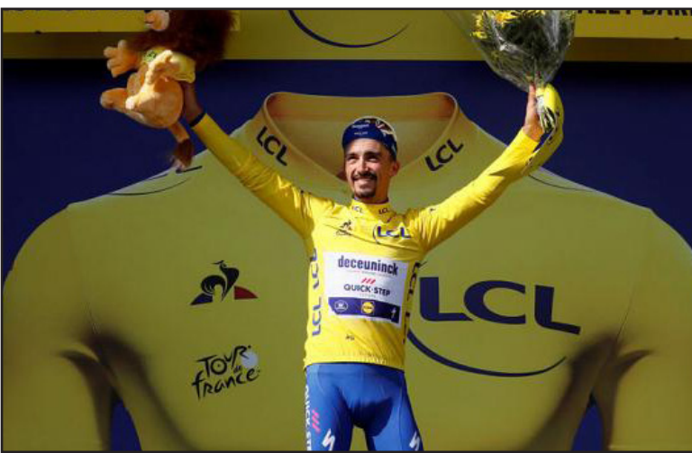
Deceuninck-Quick Step rider Julian Alaphilippe of France celebrates on the podium, wearing the overall leader's yellow jersey.

COL DU TOURMALET, France (Reuters) - Julian Alaphilippe hedged his bets when asked about his chances of winning the Tour de France, but together with Thibaut Pinot, he is leading a French renaissance that could deliver a first home title since 1985.