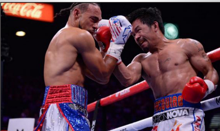
ul 20, 2019; Las Vegas, NV, USA; Manny Pacquiao (white trunks) lands a hit against Keith Thurman (red/white/blue trunks) during their WBA welterweight championship bout at MGM Grand Garden Arena.

LAS VEGAS (Reuters) - Manny Pacquiao beat defending champion Keith Thurman on a split points decision on Saturday to take the WBA Welterweight Super Championship at the end of an electrifying fight in Las Vegas.