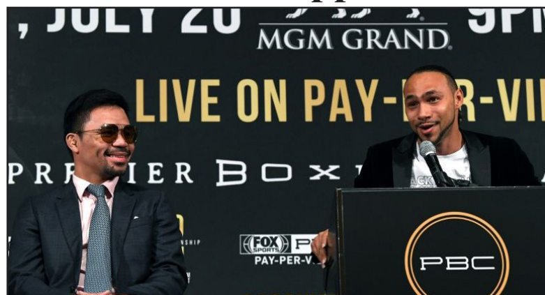
Keith Thurman (right) says his fight with Manny Pacquiao (left) is a chance to 'destroy a legend'.

LOS ANGELES (AFP) - Keith Thurman has warned he is targeting the destruction of Filipino boxing icon Manny Pacquiao when the two welterweights face off in Las Vegas later this month.