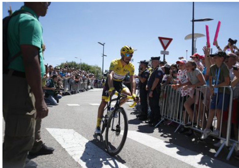
France's Julian Alaphilippe wearing the overall leader's yellow jersey arrives for the start of the fifth stage of the Tour de France cycling race over 175.5 kilometers (109 miles) with start in Saint-Die-Des-Vosges and finish in Colmar, Wednesday, July 10, 2019.

COLMAR, France (AP) - In an era where riders are becoming slaves to power meters, earpieces and all sorts of technological gadgets, Frenchman Julian Alaphilippe is bringing a much-needed dose of flair into the Tour de France.