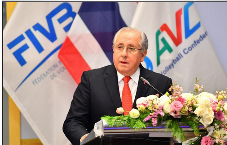
President of the International Volleyball Federation (FIVB) Ary Graça

TEHRAN (Dispatches) - President of the International Volleyball Federation (FIVB) Ary Graça has expressed shame and sorrow over the U.S. mistreatment of Iran's national volleyball team at Chicago airport.