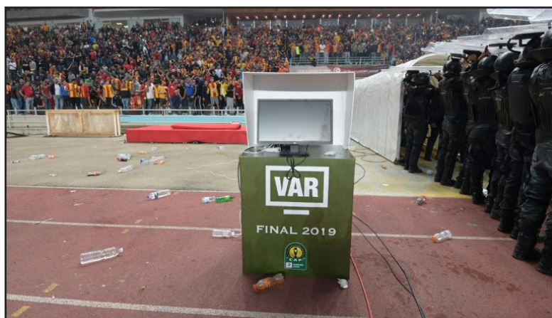
The VAR monitor that did not work at the CAF Champions League final in Tunisia two months ago, leading to the match being abandoned.

The technology was supposed to be used in the second leg of the CAF Champions League final between Esperance Tunis and Wydad Casablanca in Tunisia, but malfunctioned be-