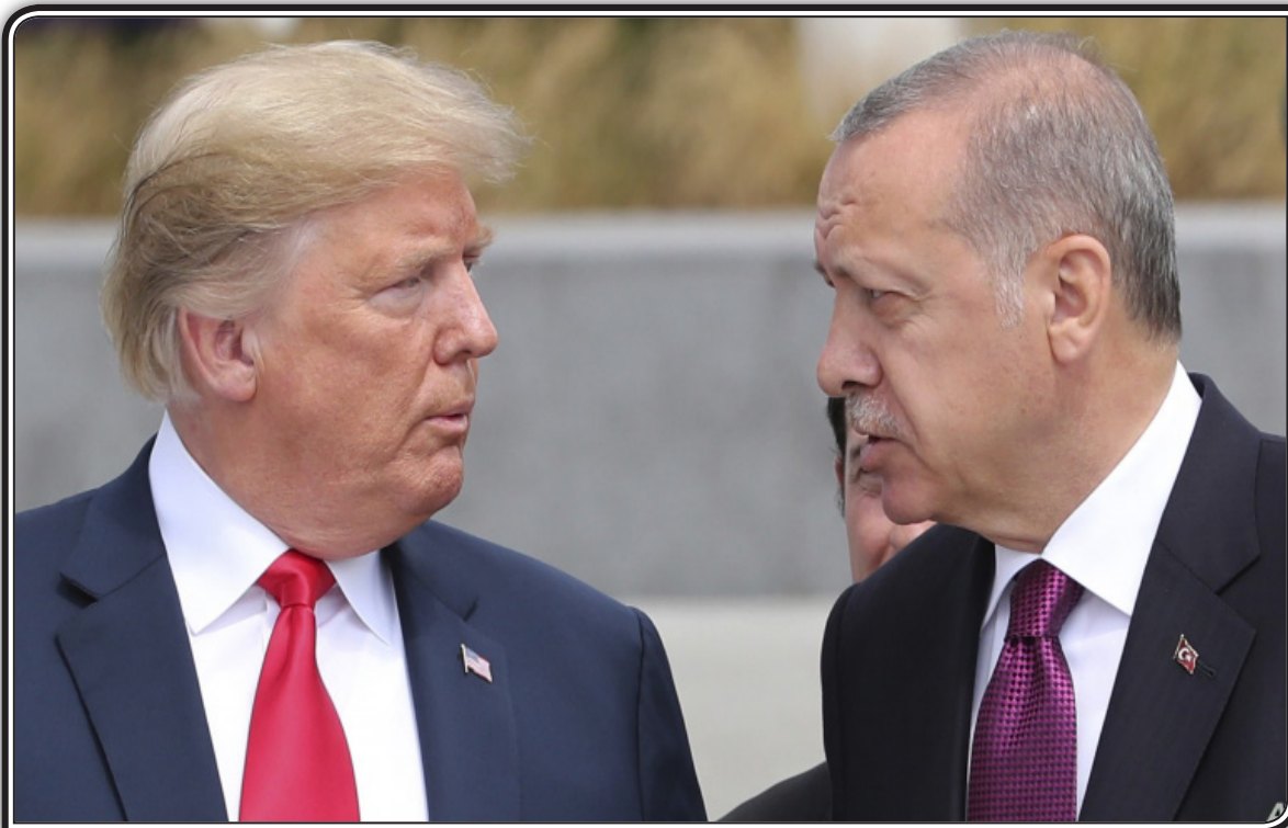
President Donald Trump, left, talks to Turkish President Recep Tayyip Erdogan, right, as they tour the new NATO headquarters in Brussels, Belgium, July 11, 2018.

ISTANBUL (Dispatches) – Turkey said on Tuesday a U.S. House of Representatives' resolution condemning Ankara's purchase of Russian systems and urging potential sanctions was unacceptably threatening.