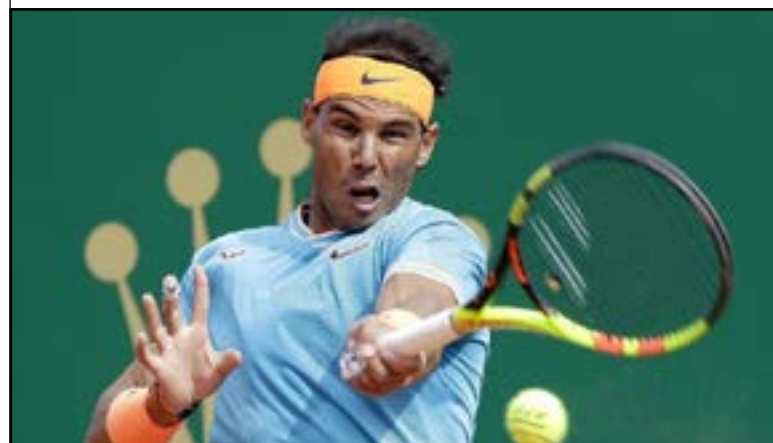
Spain's Rafael Nadal returns the ball to Italy's Fabio Fognini during their semifinal match of the Monte Carlo Tennis Masters tournament in Monaco, April, 20, 2019.