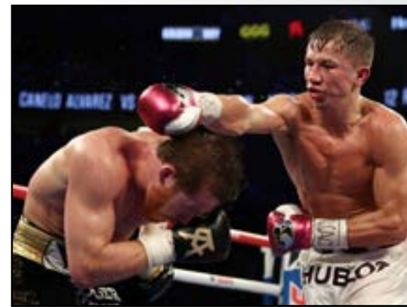
Gennady Golovkin punches Canelo Alvarez during their WBC

Golovkin (38-1-1, 34 KOs) may get his shot at