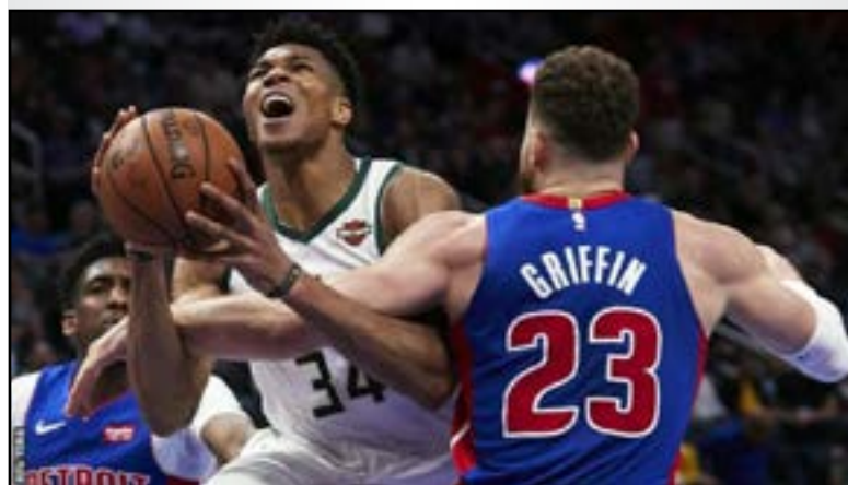
Giannis Antetokounmpo scored 41 points for the Bucks

WASHINGTON (Dispatches) - The Milwaukee Bucks beat the Detroit Pistons to establish an unassailable 4-0 lead in the best-of-seven play-off series and set up an Eastern Conference semi-final against the Boston Celtics.