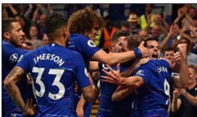
Chelsea's Argentinian striker Gonzalo Higuain (2nd right) celebrates with teammates after scoring their second goal during the English Premier League football match between Chelsea and Burnley at Stamford Bridge in London on April 22, 2019.

LONDON (AP) - Chelsea have moved into the Premier League's top four with a frustrating 2-2 draw with Burnley.