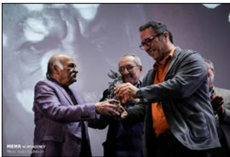
Ali Akbar Sadeghi, a globally acclaimed painter, animator, illustrator and installation artist, received the Crystal Simorgh of the 37th Fajr International Film Festival.

TEHRAN (MNA) - Ali Akbar Sadeghi, a globally acclaimed painter, animator, illustrator and installation artist, received the Crystal Simorgh