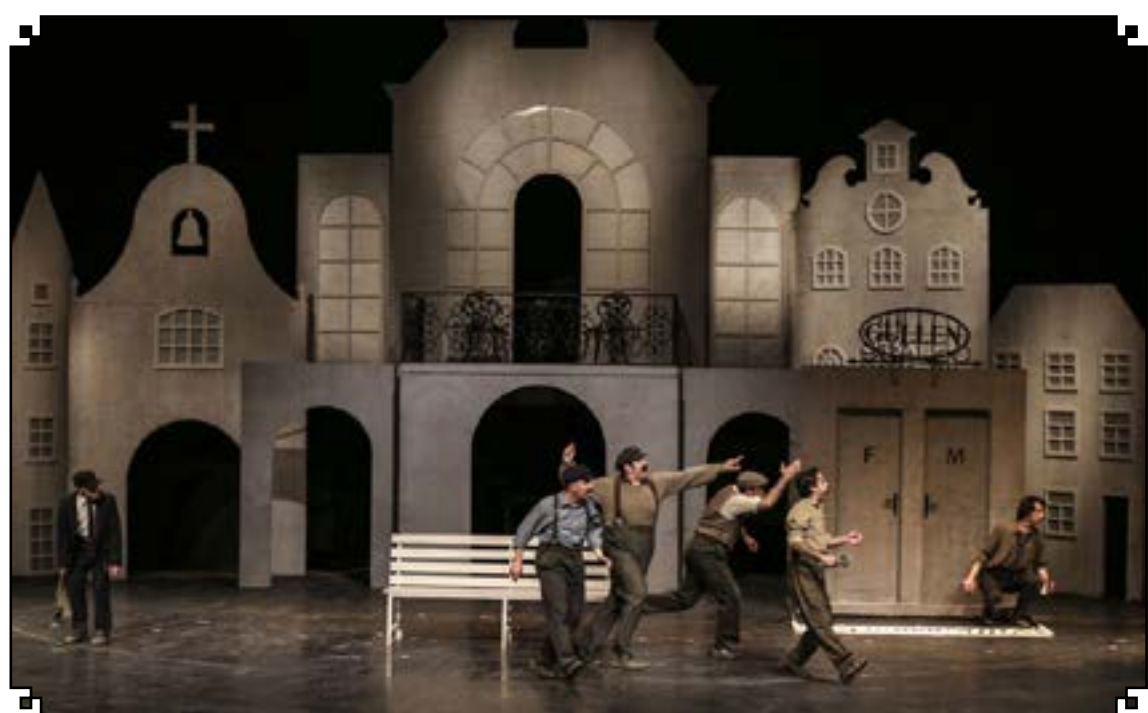
Directed by Parsa Pirouzfard, new play The Visit has gone on stage in the City Theater of Tehran until 21 May. The Visit is a 1956 tragicomic play by Swiss dramatist Friedrich Dürrenmatt.