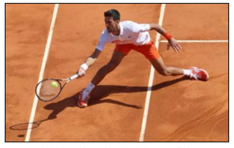
Djokovic was beaten by Medvedev in Monte Carlo

to close on the top 10, while Lajovic climbed 24 places to