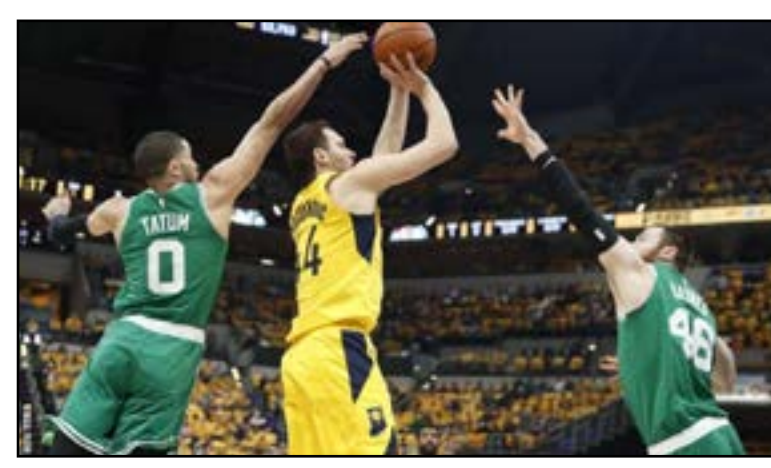
Boston (green shirts) claimed the final quarter 37-34 at Indiana's Bankers Life Fieldhouse venue

BOSTON (Dispatches) - Boston Celtics became the first team to advance from the NBA play-offs, taking an unassailable 4-0 lead over Indiana Pacers in the best-ofseven series.