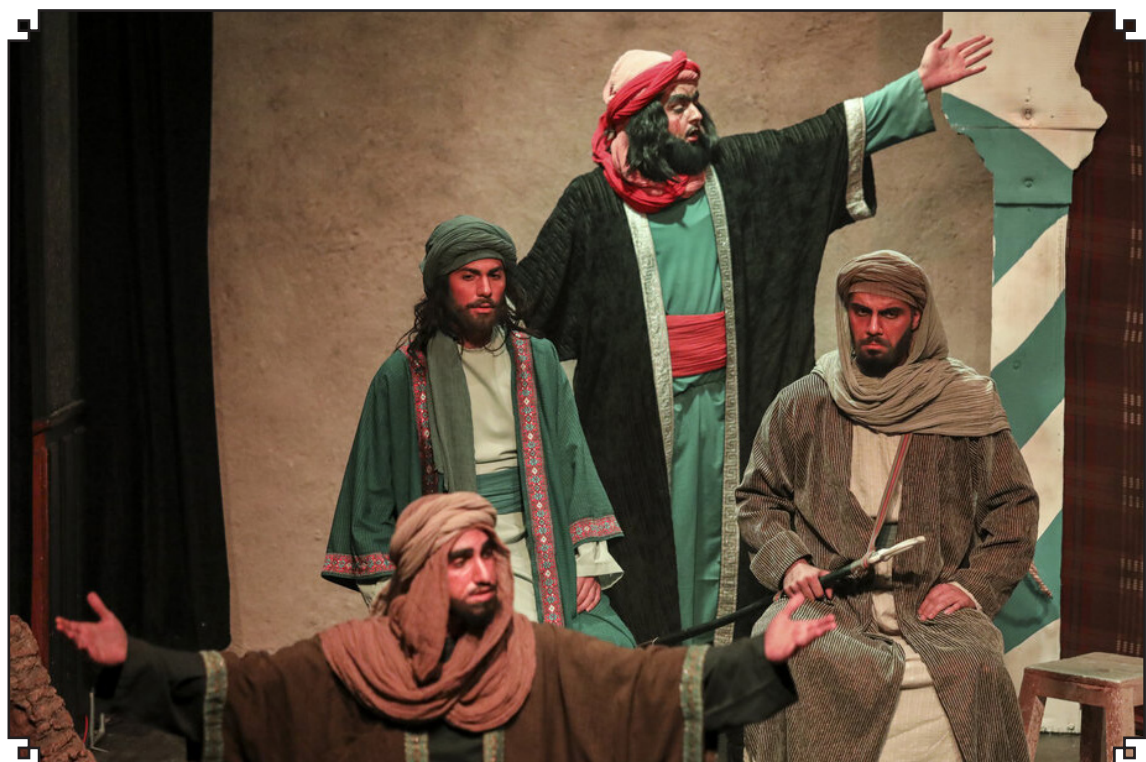
The ritual play entitled "Khazan-e-Arghavan" has gone on stage in Tehran's Ebn-e-Sina Cultural House on the occasion of the anniversary of the martyrdom of Hazrat Zahra (SA), the daughter of Prophet Muhammad (PBUH).