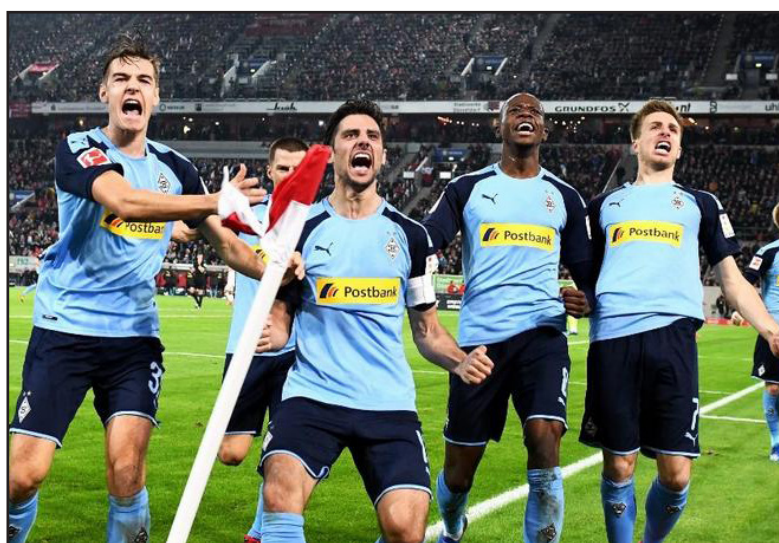
Monchengladbach's German forward Lars Stindl (center) celebrates scoring with his team-mates during the German first division Bundesliga football match Fortuna Dusseldorf v Borussia Monchengladbach in Dusseldorf, western Germany on Feb 15, 2020.

Fortuna remained unimpressed and responded well on home soil as Erik Thom-