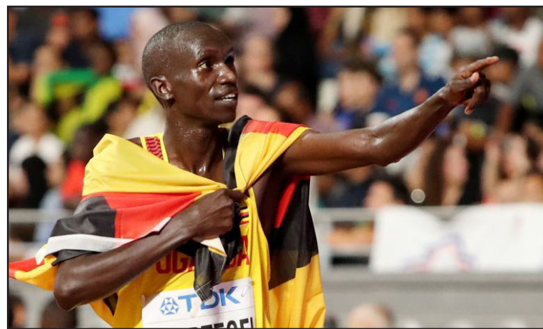
Uganda's Joshua Cheptegei

MONACO (Reuters) - Uganda's Joshua Cheptegei shattered the 5km road world record in Monaco on Sunday, shaving 27 seconds off the mark set by Kenya's Rhonex Kipruto last month.