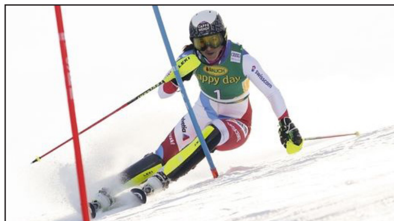
Switzerland's Wendy Holdener speeds down the course during an alpine ski, women's World Cup slalom in Kranjska Gora, Slovenia, Sunday, Feb. 16, 2020.

KRANJSKA GORA, Slovenia (AP) -- Petra Vlhova won her third straight women's World Cup slalom Sunday to overtake the absent Mikaela Shiffrin on the top of the discipline standings.