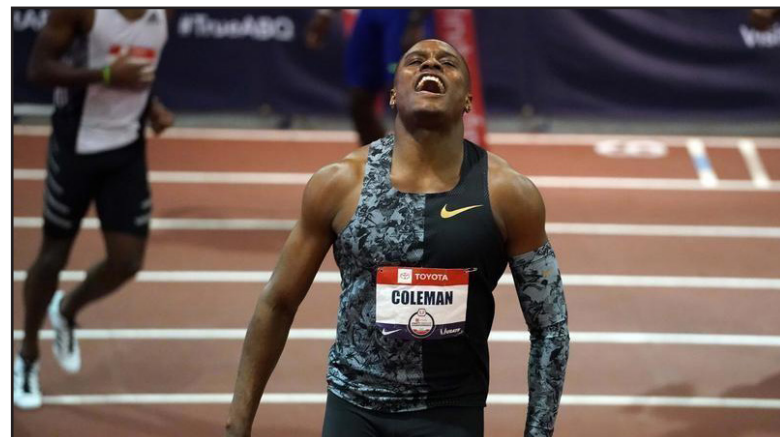
Christian Coleman celebrates after winning the 60m in 6.37 at Albuquerque Convention Center.

NEW MEXICO (Reuters) - World record holder Christian Coleman equalled the second-fastest 60m ever and Olympic champion Ryan Crouser narrowly missed the indoor shot put world record at the U.S. championships in New Mexico on Saturday.