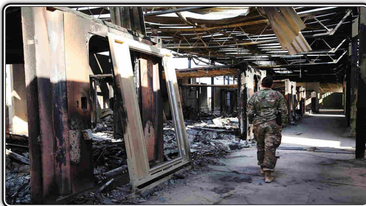
Damage from some of the ballistic missiles fired by Iran is visible at Ain al-Assad air base.

TEHRAN (Press TV) -- The spokesman for the Islamic Revolution Guards Corps said Saturday Washington's alleged numbers of "brain injuries" in its troops following the Iranian retaliatory missile strike on the Ain al-Assad airbase represent the number of dead troops.