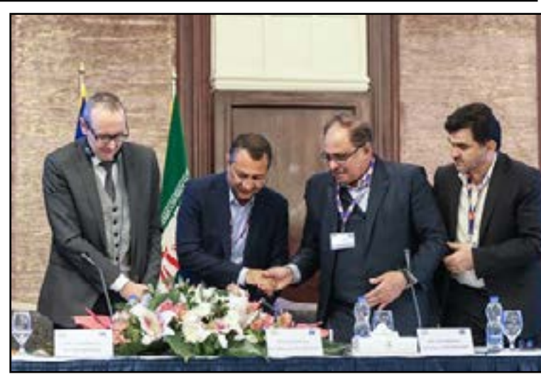
The EU delegation is also hold talks with high-ranking officials