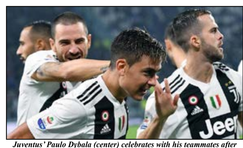
scoring his team's first goal during the Italian Serie A soccer match between Juventus and Cagliari at the Allianz Stadium in Turin, Italy, Nov 3, 2018.

Juventus equaled the record set by Roma in the 2013-14 season and Napoli in 2017-18, and it has only dropped points in a 1-1 draw at home to Genoa.