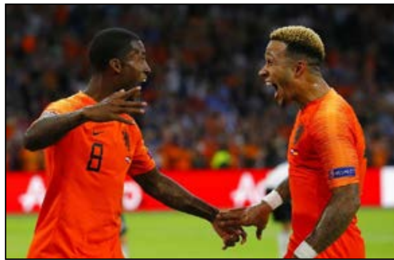
Netherlands' scorer Georginio Wijnaldum, left, celebrates after he scored his side's third goal with Netherlands' second scorer Memphis Depay, right, during the UEFA Nations League soccer match between The Netherlands and Germany at the Johan Cruyff Arena in Amsterdam, Oct 13, 2018.

AMSTERDAM (Dispatches) - Germany's UEFA Nations League campaign took a humiliating blow after a 3-0 loss at old rival Netherlands.