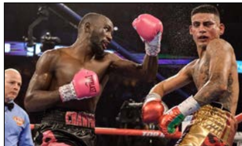
Crawford has 25 knockouts from 34 fights

LONDON (Dispatches) - Terence Crawford retained his WBO welterweight title and extended his unbeaten record to 34 wins with a 12th-round stoppage of Jose Benavidez Jr.