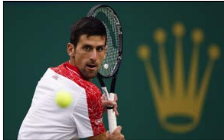
Novak Djokovic of Serbia eyes on the ball as he plays against Borna Coric of Croatia during their men's singles finals match in the Shanghai Masters tennis tournament at Qizhong Forest Sports City Tennis Center in Shanghai, China, Sunday, Oct. 14, 2018.

SHANGHAI (AP) - Novak Djokovic won a record fourth Shanghai Masters title with a 6-3, 6-4 win over 13th-seeded Borna Coric on Sunday.