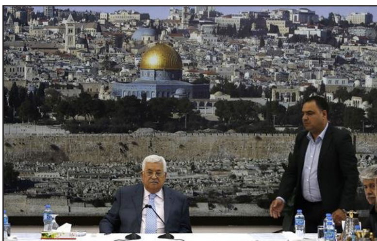
Palestinian President Mahmoud Abbas (seated) chairs a meeting of the Palestine Liberation Organization (PLO) Executive Committee at the Palestinian Authority headquarters in the West Bank city of Ramallah, September 15, 2018.

In that war — also known as the Six-Day War, the Zionist regime took over Arab and Palestinian land that it continues to occupy to