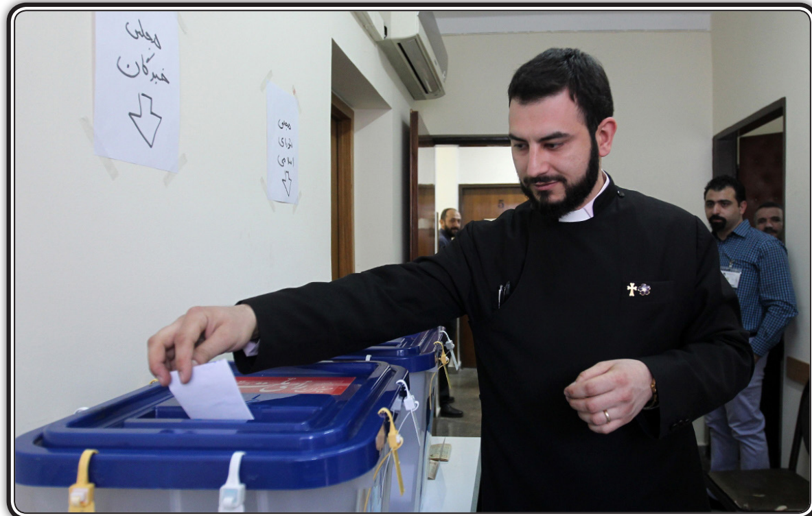
Iranian Christians stand in line at a church to cast their votes during elections for the parliament and Assembly of Experts in Tehran February 26, 2016.

TEHRAN (Dispatches) - Iran's Assyro-Chaldean churches have censured U.S. officials' "interventionist" claims about the situation of religious minorities in the Islamic Republic, calling on Washington to be concerned about its own poor human rights record at home and abroad instead of shedding "crocodile tears" for others.