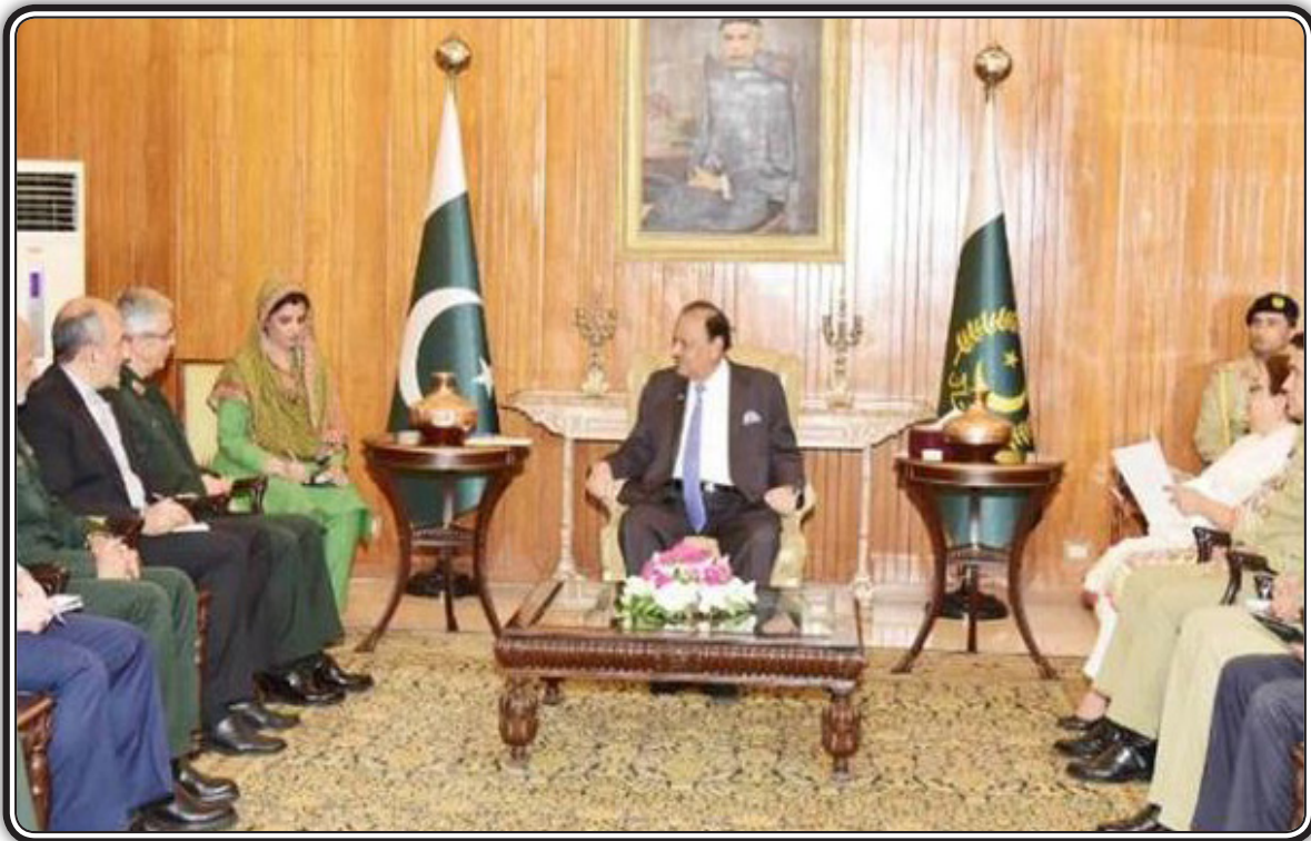
Pakistani President Mamnoon Hussain (C) meets with Chairman of the Chiefs of Staff of the Iranian Armed Forces Major General Mohammad Baqeri in Islamabad on July 17, 2018.

TEHRAN (Dispatches) - Iran's top military commander has emphasized the importance of enhancing defense relations with Pakistan, saying the two neighbors are seeking to jointly manufacture defense equipment.