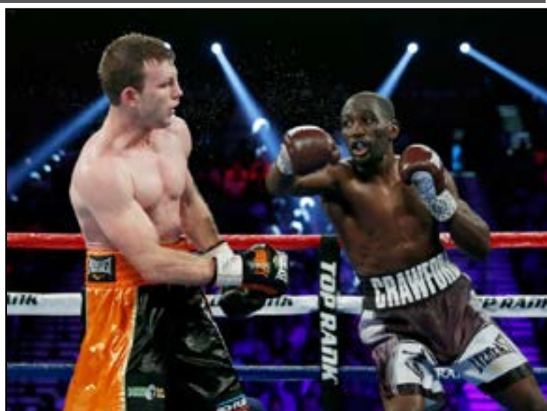
Jeff Horn (L) and Terence Crawford battle in the seventh round of their WBO welterweight title fight, at MGM Grand Garden Arena in Las Vegas, Nevada, on June 9, 2018

With the win Crawford claimed a world title in a third weight division.