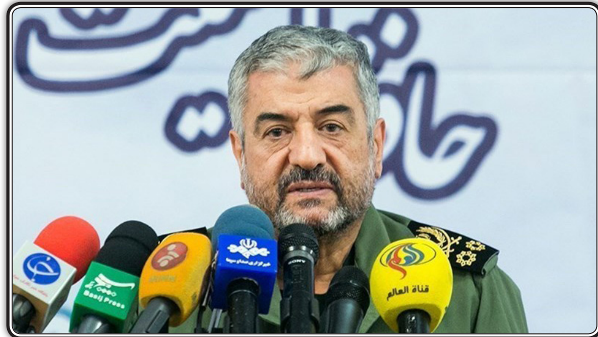
Islamic Revolution Guards Corps (IRGC) Commander Major General Mohammad Ali Jafari

TEHRAN (Dispatches) – Islamic Revolution Guards Corps (IRGC) Commander Major General Mohammad Ali Jafari decried the inaction and silence of some “treacherous” regional countries on the Zionist regime’s crimes against Palestinians in the Gaza Strip, which coincided with the inauguration of the U.S. embassy in Jerusalem al-Quds, and said they are complicit in the oppression.