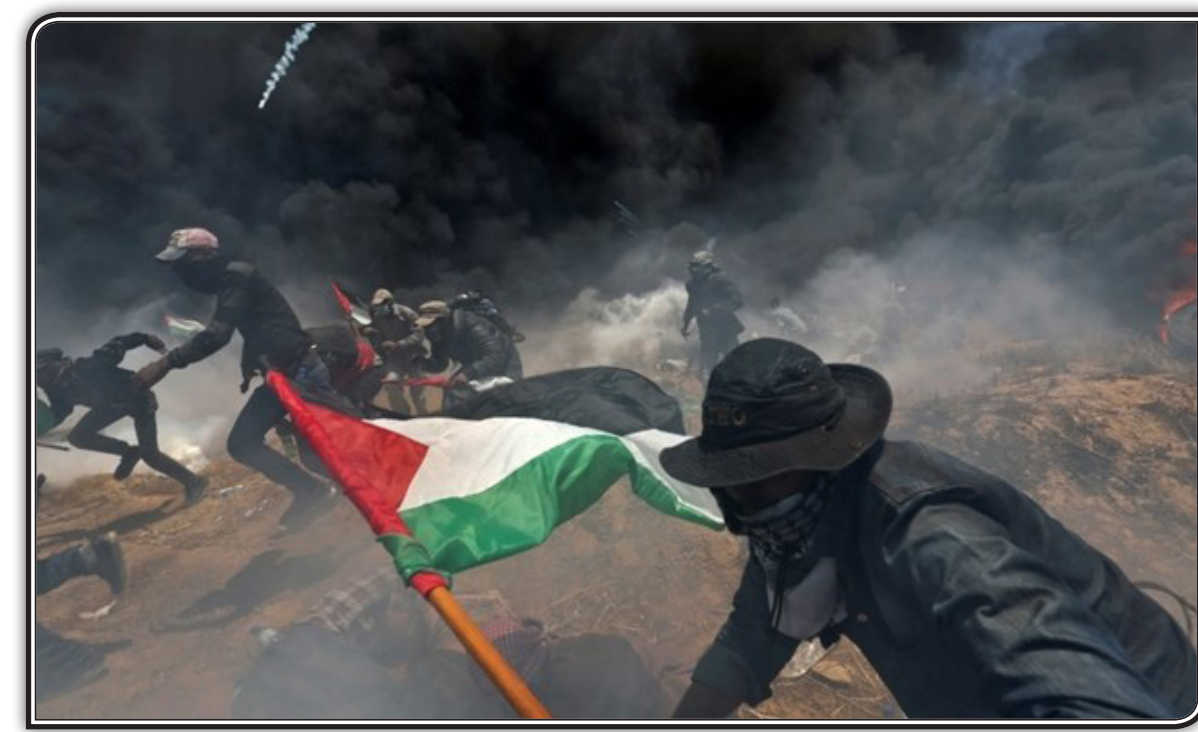
Palestinian demonstrators run for cover from Israeli fire and tear gas during a protest against U.S. embassy move to Jerusalem Al-Quds and ahead of the 70th anniversary of Nakba, near the Gaza fence in the southern Gaza Strip, May 14, 2018.

GAZA (Dispatches) -- Israeli forces shot dead a Palestinian near the Gaza fence border Tuesday after thousands of Palestinians turned out for the funerals of dozens of protesters killed by Zionist troops a day earlier, local health officials said.